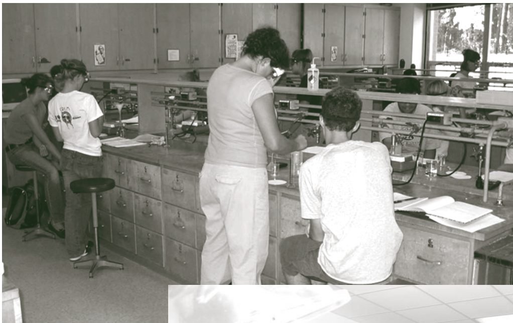
Lyman Briggs laboratories before renovation

The Lyman Briggs School opened in 1967 as a residential college with a math and science focus.