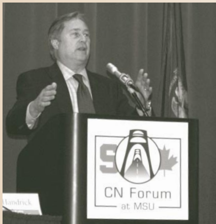
Former Michigan Governor James J. Blanchard delivers the keynote address at the first annual CN Forum on Canada-U.S. Relations.

An MSU graduate, Governor Blanchard remarked that he was