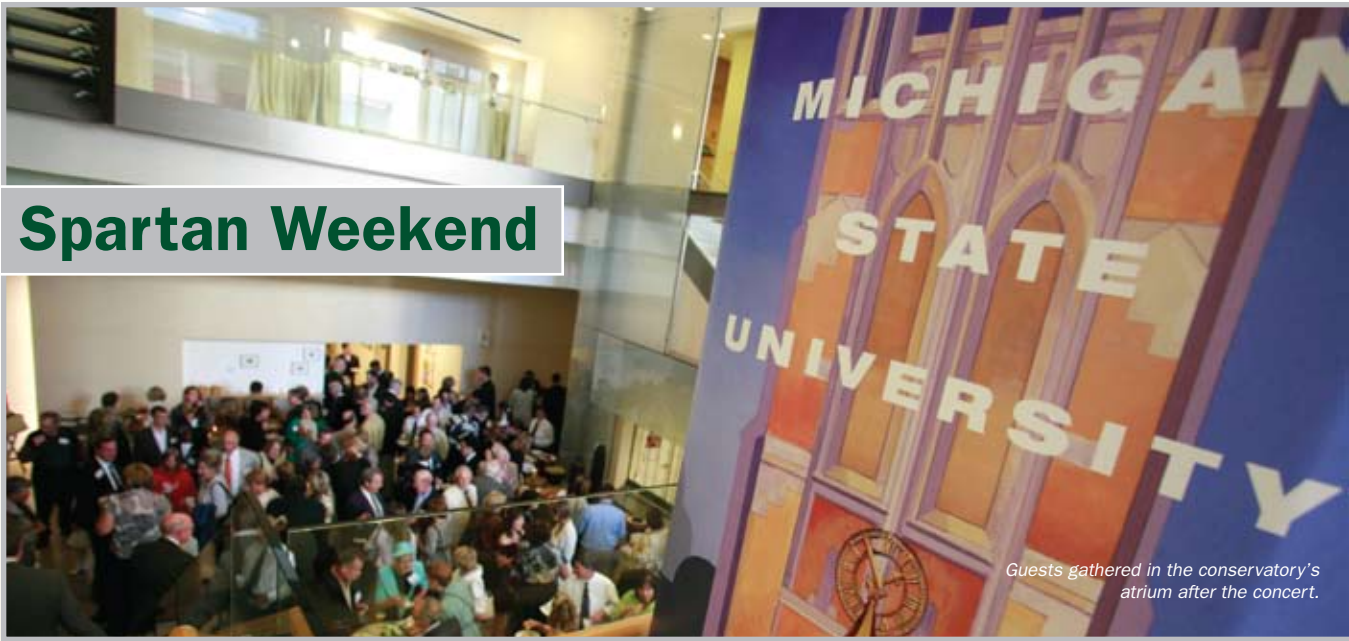
Guests gathered in the conservatory's atrium after the concert.