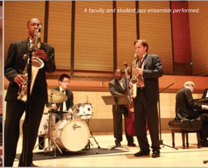
A faculty and student jazz ensemble performed.