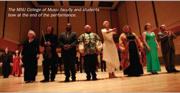
The MSU College of Music faculty and students bow at the end of the performance.