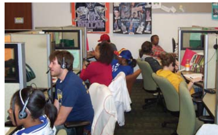
Telemarketing students contact alumni and friends throughout the week.

In many cases, the student callers of MSU Telemarketing are the only voice MSU alumni hear in regards to what is happening both on campus and