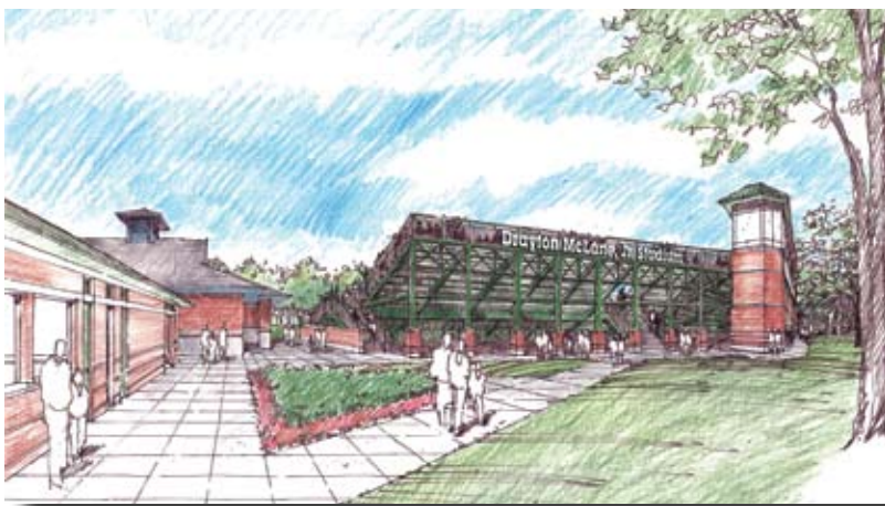
Artist rendering of the McLane Baseball Stadium