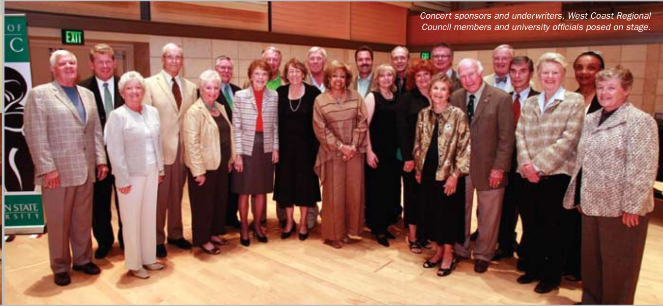
Concert sponsors and underwriters, West Coast Regional Council members and university officials posed on stage.

NON-PROFIT ORG. US POSTAGE PAID E. LANSING, MI PERMIT #21