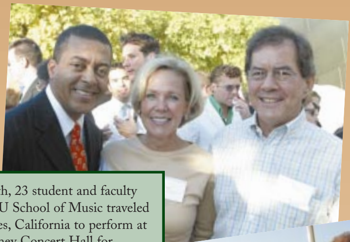
Left and Below: Guests enjoyed mingling in the Blue Ribbon Garden after the concert.