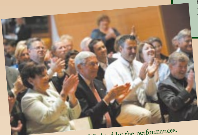
Audience members were delighted by the performances.