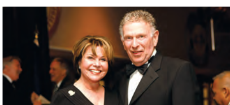
Cohen gift crowns student athletic and academic success