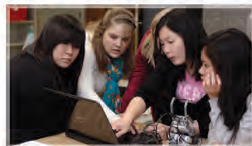
Students in the Residential Experience in Engineering in Wilson Hall.

Students in the Residential Experience program live in Wilson Hall with other engineering students as well as those from other majors and colleges, promoting cross-disciplinary interactions. They learn from each