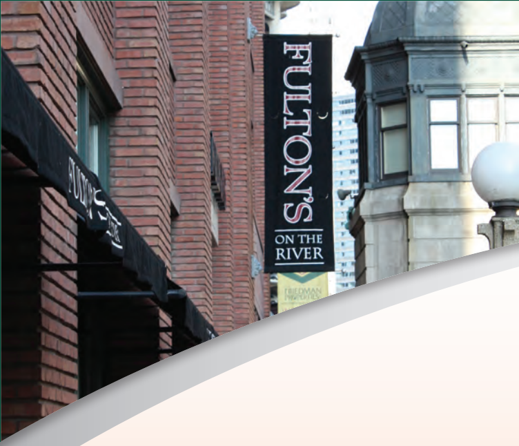
Dozens of Spartans gathered at the beautiful Fulton's on the River in Chicago.