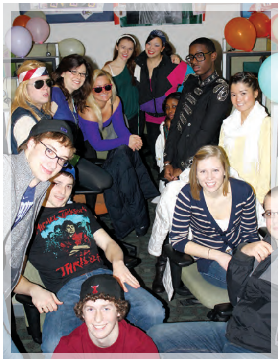
Greenline callers pause for a picture at the end of the 80s theme shift.

It's not your typical work place. For one thing, no one appears to be over the age of 25. The workstations are compact cubbies equipped with computer screens and each worker is wired in to a headset. No one looks tired, stressed or unhappy despite the fact that the hour is fast approaching 10:00 p.m.