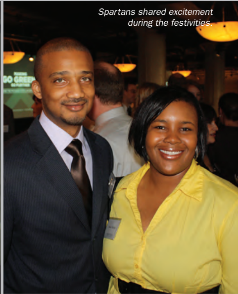
Spartans shared excitement during the festivities.