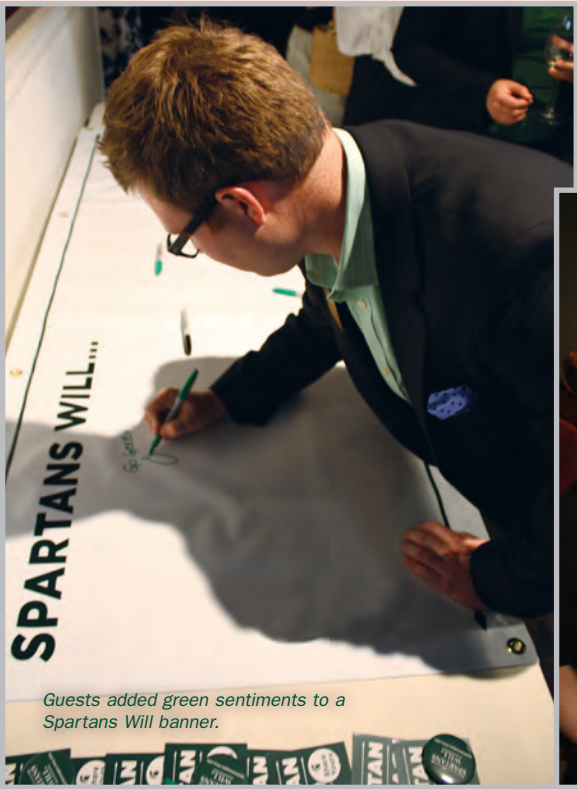
Guests added green sentiments to a Spartans Will banner.