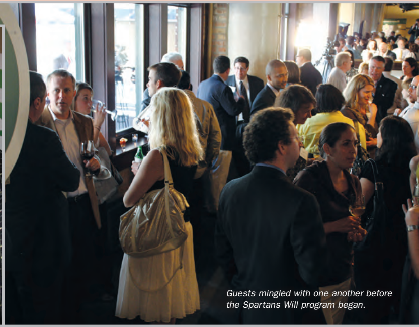
Guests mingled with one another before the Spartans Will program began.